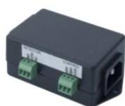
PowerEgg 600 237