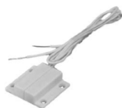
Door Contact 600 119