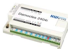
Damocles 2404i 600 374