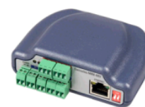
Damocles MINI 600 250